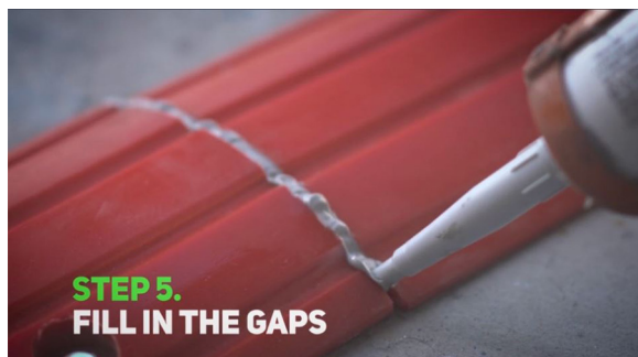
STEP 5. FILL IN THE GAPS