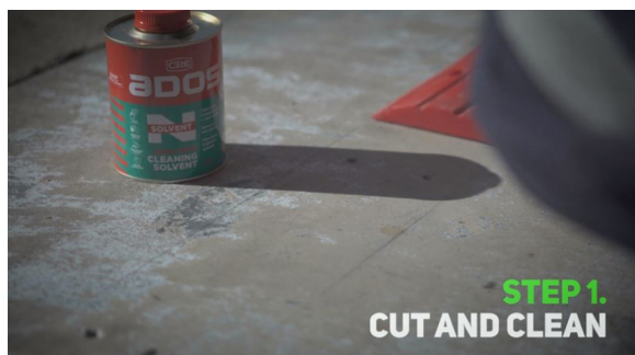
STEP 1. CUT AND CLEAN