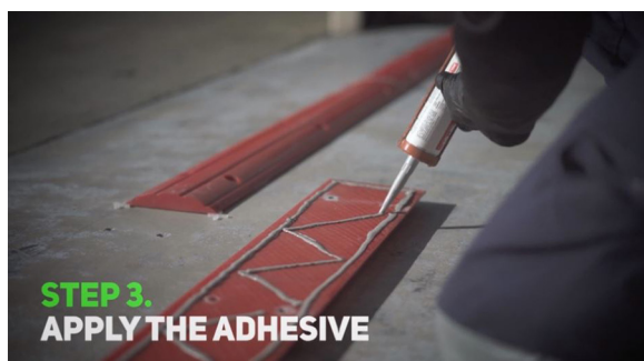
STEP 3. APPLY THE ADHESIVE