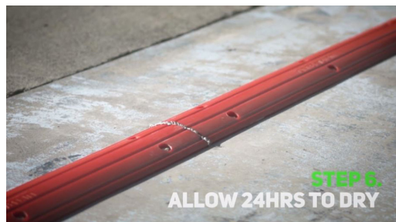
STEP 6. ALLOW 24HRS TO DRY