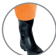
Sewn-in socks in the suit material or attached boots