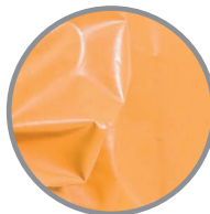
Strong and flexible suit material with excellent abrasion and flame resistance, provided by the aramid base fabric and the outer layer of chloroprene rubber