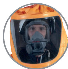
Large VP1 visor. Alternatively CV wide vision visor with 3D depth of 20 cm, giving extra side view