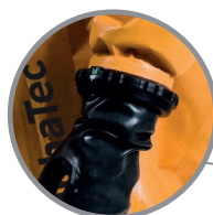
Bayonet glove ring system for quick and simple glove exchange