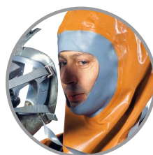
Anatomically designed face seal for optimum safety and comfort