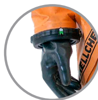
Bayonet glove ring system for quick and simple glove exchange