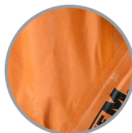
Strong and flexible suit material with excellent abrasion and flame resistance, provided by the aramid base fabric and the outer layer of chloroprene rubber