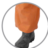
Attached boots or sewn-in socks in the suit material