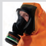
Neoprene rubber face seal