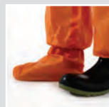
Socks with boot overflap