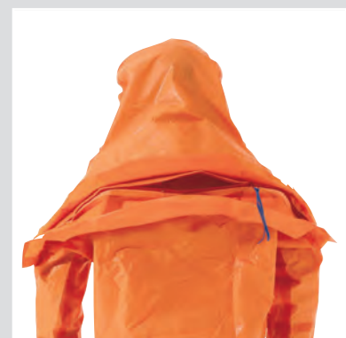
Rear entry double zip system